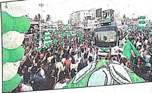
Odisha Chief Minister Naveen Patnaik in Puri.